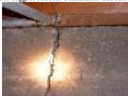
Monitor foundation crack