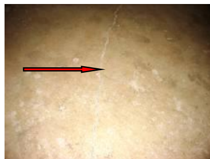
Crack in basement slab