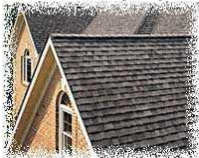
Roofing in good shape

Please also refer to the pre-inspection contract for a detailed explanation of the scope of this inspection.